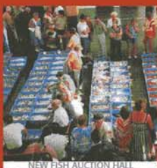
NEW FISH AUCTION HALL