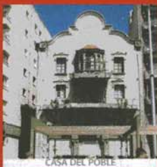
CASA DEL POBLE