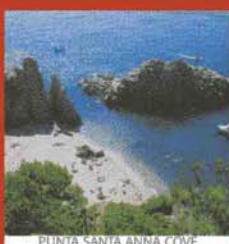
PUNTA SANTA ANNA COVE