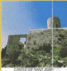
CASTLE OF SANT JOAN