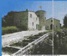
CHAPEL OF SANTA BÀRBARA