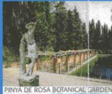
PINYA DE ROSA BOTANICAL GARDEN