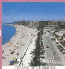
PASSEIG DE LA MARINA