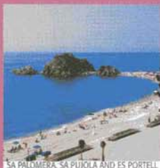
SA PALOMERA, SA PUJOLA AND ES PORTELL