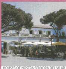
HOUSES OF NOSTRA SENYORA DEL VILAR